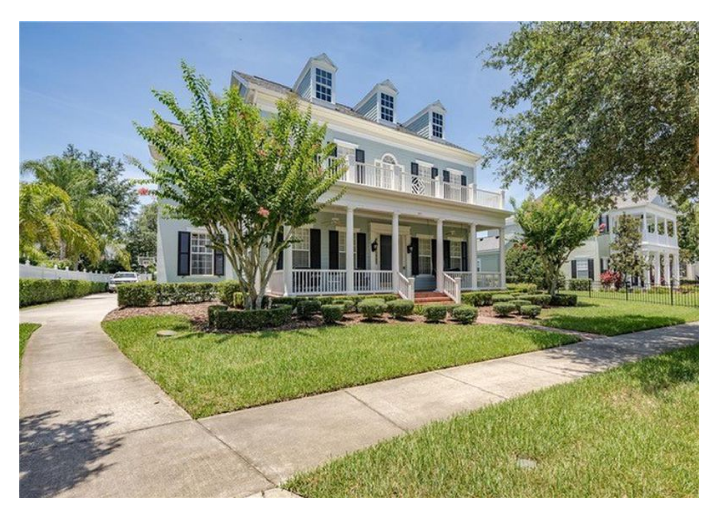
Former NBA star Brad Daugherty sold this $1 million Celebration home to a local couple with a growing family.

growthspotter.com /news/notable-home-sales/gs-news-daugherty-notable-home-celebration-20191205-45fegtbhhzb65ip4pbcrbthbci-By Tiffani Sherman