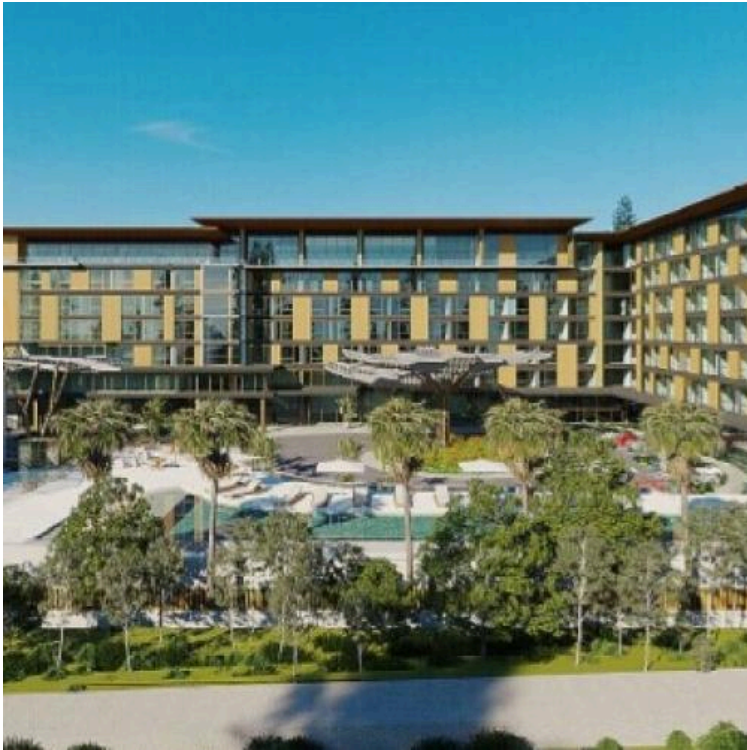
‘One of a kind’ hotel planned for land near Disney moves closer to construction