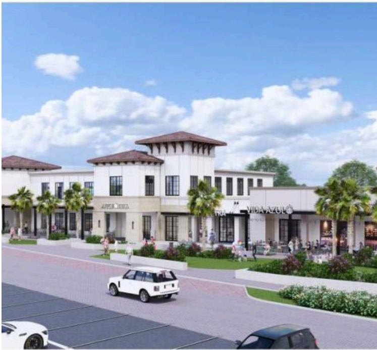
New dining and retail coming as ChampionsGate West moves forward