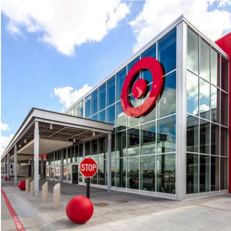
Osceola County drops objection to Target-anchored shopping center in Poinciana