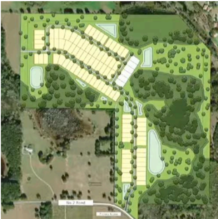
Lake board delays Cedar Creek subdivision density bonus, to reconsider in May.