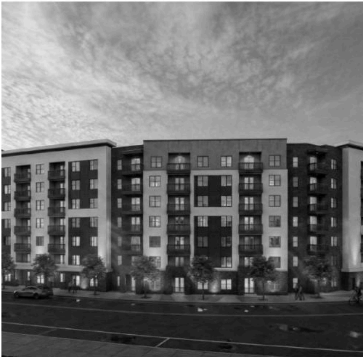
Gables Residential planning apartments in downtown Orlando