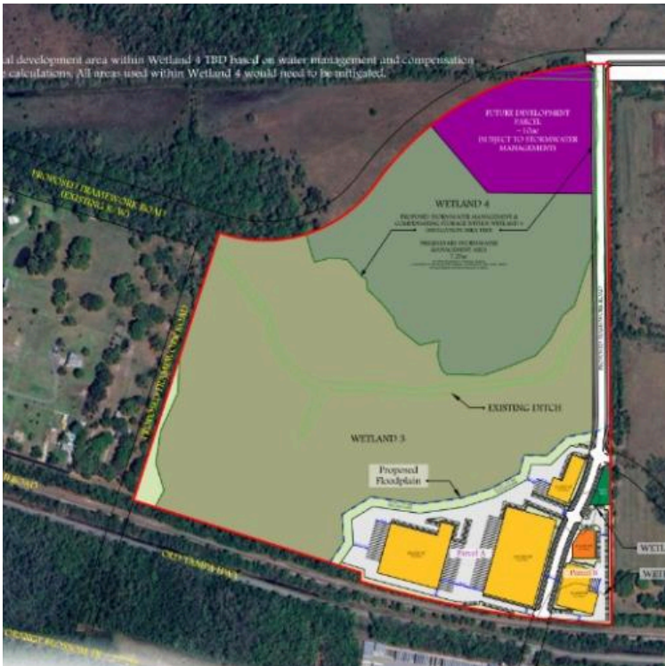
Developer eyes Kissimmee logistics park site for Live Local apartments