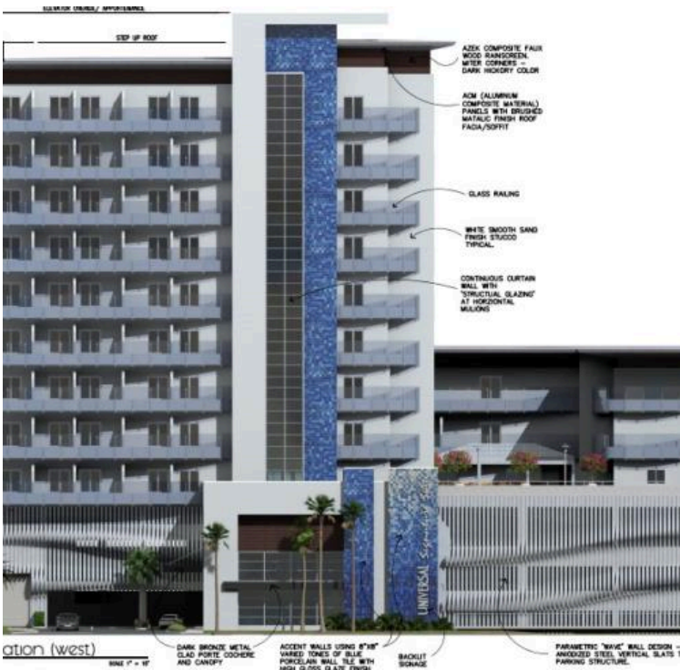
Developer Harb planning ‘Signature Suites’ hotel near Epic Universe