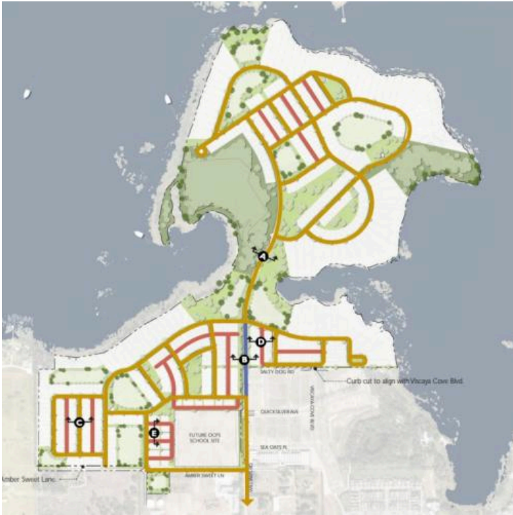
Johns Lake UVPUD project in Winter Garden preparing for city consideration