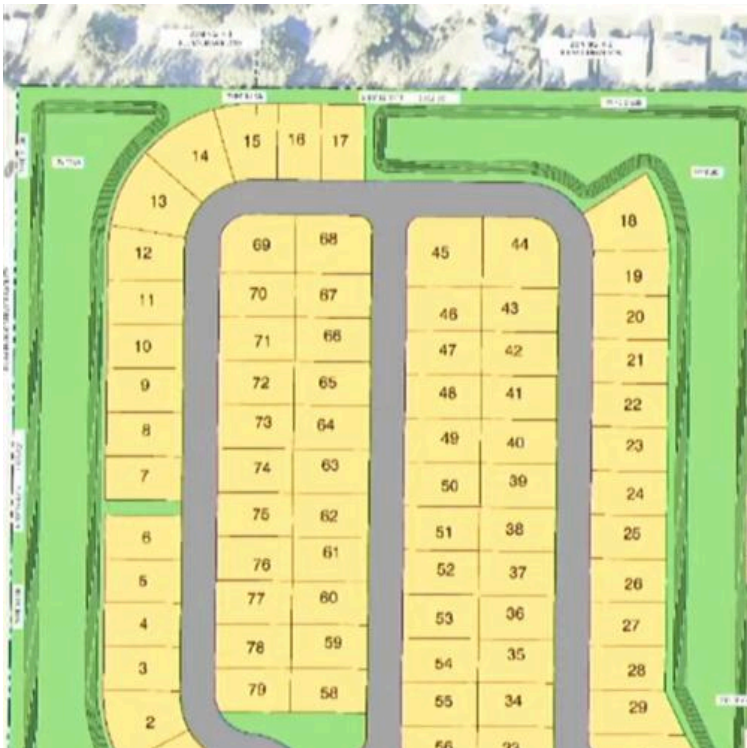
Lake board deny agreement for proposed KB Home subdivision near Clermont