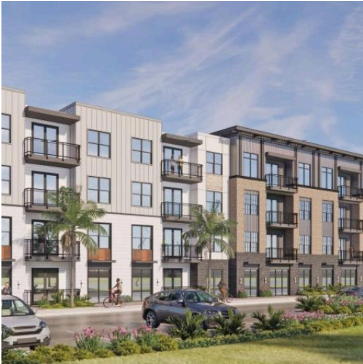
Sanford leaders agree to no retail in apartment complex