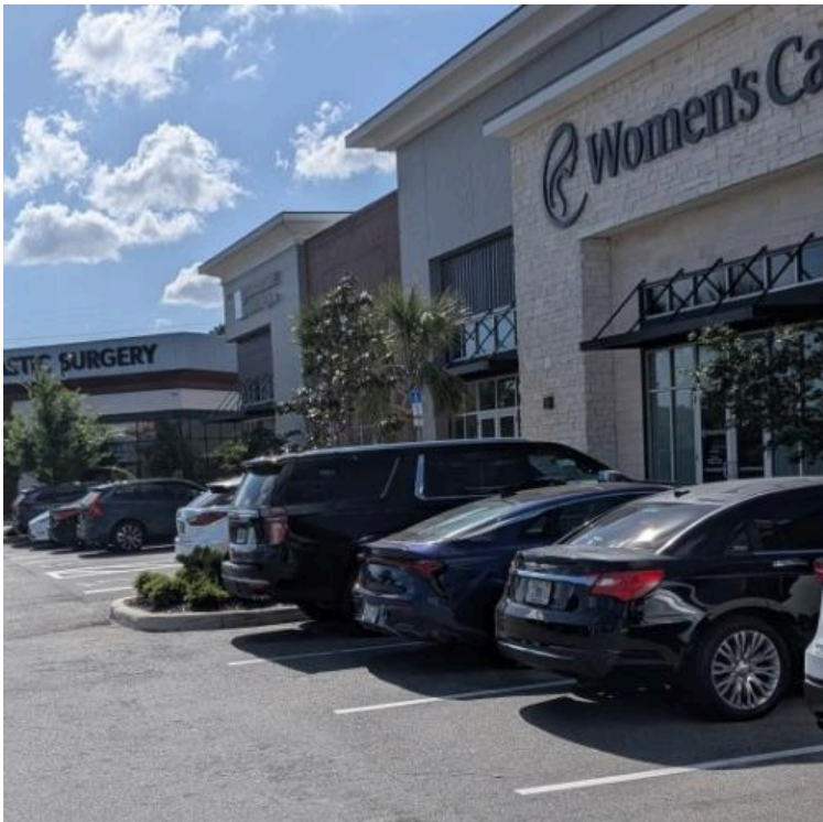
Next phase of Hamlin medical offices project advances in Horizon West