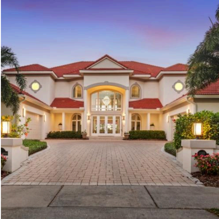
Keene's Pointe home with lake views sells quickly in cash deal