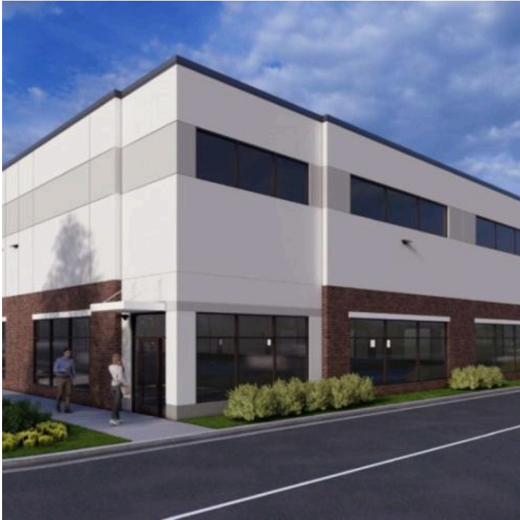
Oakland advances plan for shallow-bay industrial park at nexus of SR 50, Turnpike