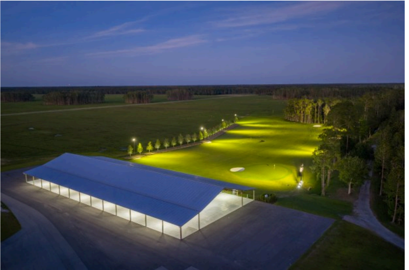
The ranch has a state-of-the-art golf facility inspired by Augusta National, with a lit driving range and world-class short game area.