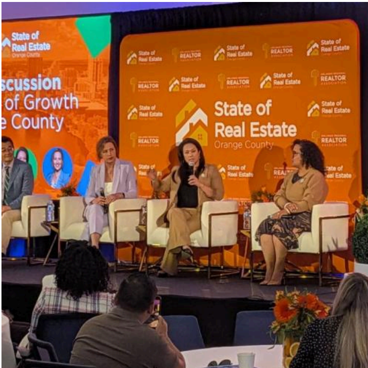
10 things we learned at ORRA's State of Real Estate